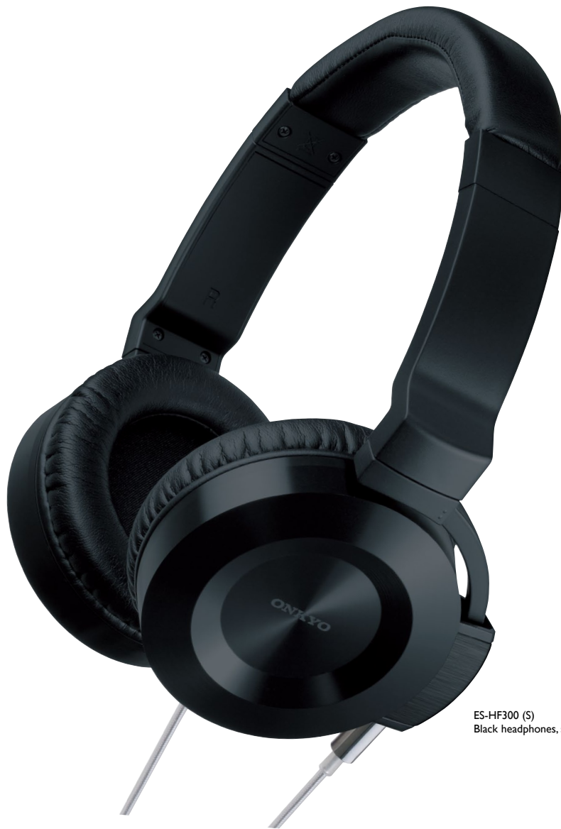
ES-HF300 (S) Black headphones, silver cable