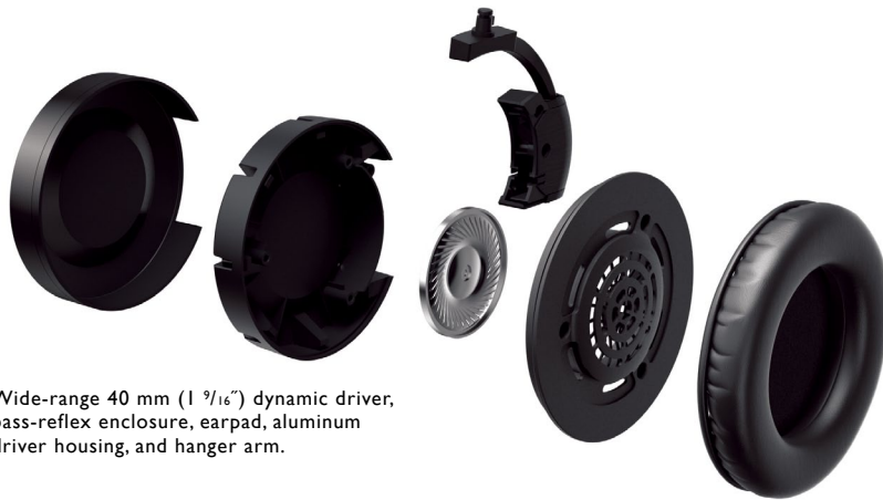
Wide-range 40 mm (1 9/16") dynamic driver, bass-reflex enclosure, earpad, aluminum driver housing, and hanger arm.

Soft leatherette earpads provide a good seal against ambient noise and minimize sound leakage. Combined with an adjustable headband—which is padded to relieve stress at contact points—the ES-HF300s are comfortable to wear for hours at a time.